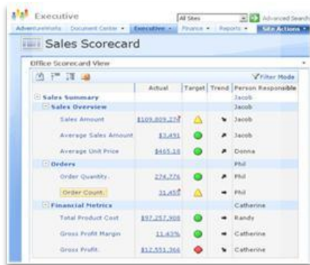
Key Performance Indicators

Manage enterprise-wide key performance indicators (KPI's) centrally by using the Analysis Services KPI Framework — a rich centralized repository for defining, storing, and managing KPIs. Make centrally stored KPIs available to users through a variety of applications, including Microsoft Office PerformancePoint™ Server 2007, Microsoft Office Excel® 2007, Microsoft Office SharePoint® Server 2007, and SQL Server Reporting Services